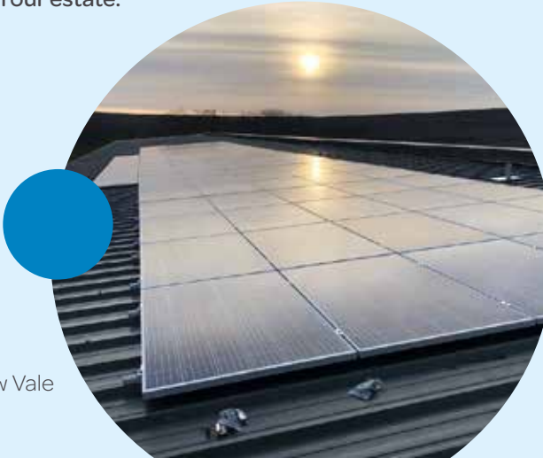
Silent Valley, Ebbw Vale

Although not an immediate project opportunity, inclusion of this project within this prospectus demonstrates the Council's commitment to developing a portfolio of energy projects offering both immediate savings and long term investment in our estate.